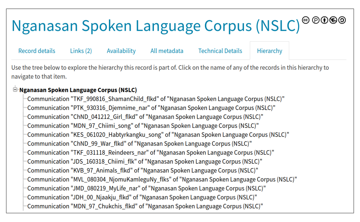
Figure 1: A simple structured CMDI record in the VLO.

different metadata profiles, for content to correctly fill the various facets ( e.g. , language , resource type , modality , format ) that users will use to conduct faceted search in the VLO front-end. Once users have found a resource of interest, its individual metadata records are presented in a tabbed user interface, which includes a listing of its constituent parts via a simple hierarchical representation ( cf. Fig. 1). Many descriptions in the VLO, however, are highly structured CMDI records. Navigating such metadata in such a tabbed environment, where a tabular entry points to a complex structure, involves following persistent identifiers attached to substructures manually . Hence, it can take some time to identify a sub-tree's leaves where, say, the auditive stimuli of a study of interest can be found.