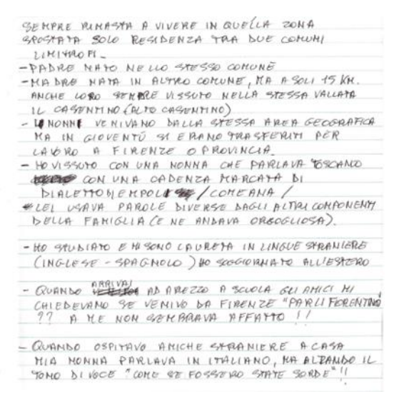
Figure 3. A hand-written linguistic autobiography from the University of Siena corpus

This will allow the corpus to grow constantly, with new autobiographies being periodically added to the original collection.