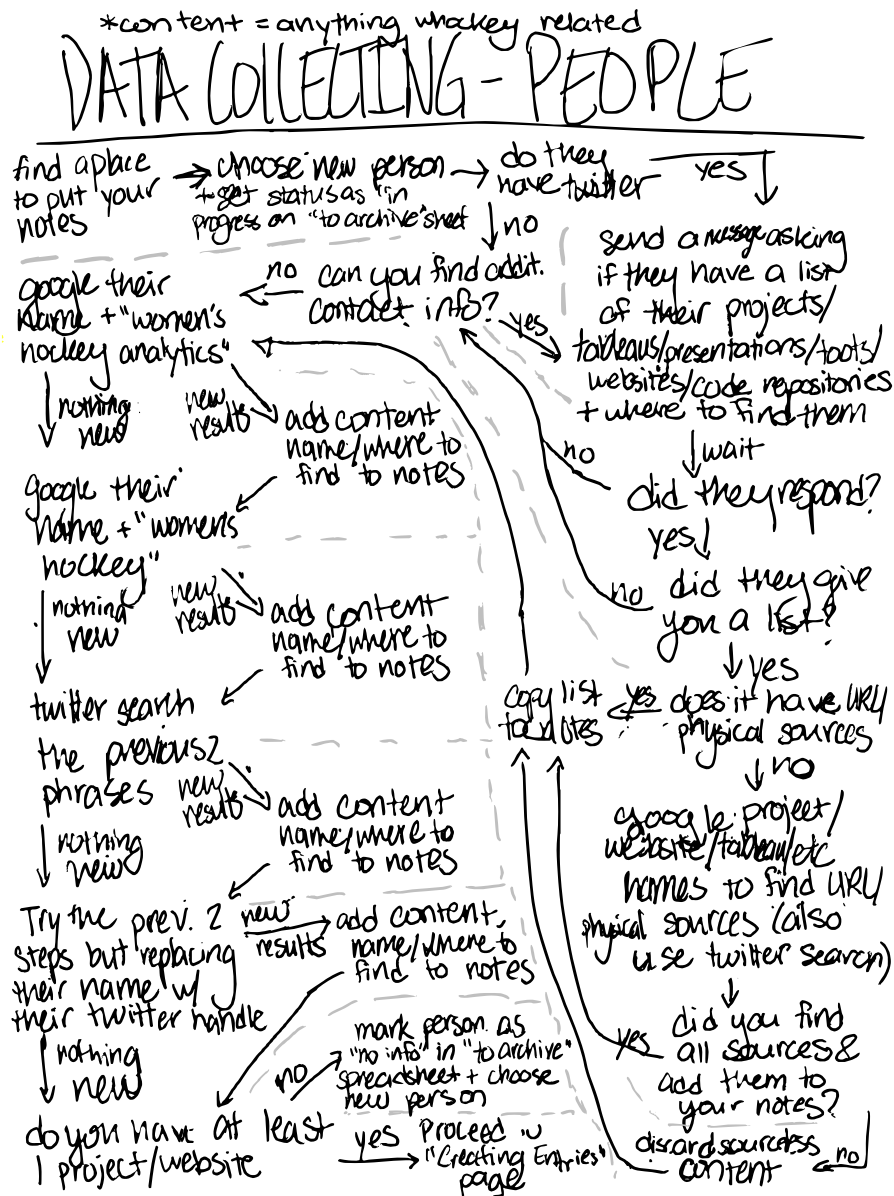
Fig. 1. The first page of the "How to Archive" instructional guide designed to guide a layperson through how to start with a name from the people section of the "To Archive" document, search for the publications, data sources, and events they have been involved with and create detailed MetaHockey entries from those search results.