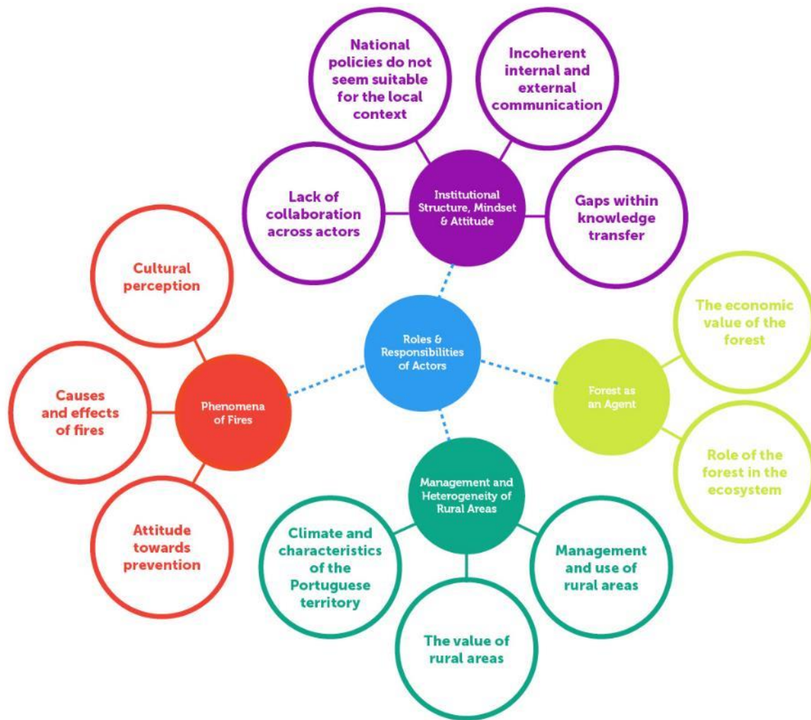
Figure 2. Visual representation of the five themes (and sub-themes) that emerged from the analysis.