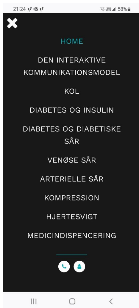
Figure 3. Screenshot of the pull-down menu with items representing the most prominent diseases and reasons for receiving community nursing: ‘The interactive communication model’, ‘COPD’, ‘Diabetes and insulin’, ‘Diabetes and diabetic ulcers’, ‘Venous ulcers’, ‘Arterial ulcers’, ‘Compression’, ‘Heart failure’, and ‘Medicine dispensing’.

The content of the IT solution is selected based on the most prominent diseases and reasons for receiving community nursing in Northern Jutland. People receiving community nursing are often very vulnerable with multiple health-related challenges and comorbidities – setting high requirements to their level of HL. The idea is that the ICM (made available in the web-based IT solution) supports community nurses in accommodating citizens' broad range of information and communication preferences. Instead of assuming what people know, the model uncovers what they know, thus, it is a more objective approach to accessing knowledge and skills.