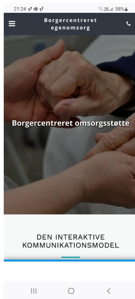
Figure 2. Screenshot of the start page of the web-based IT solution ‘Personalised support for self-care’.

The ICM must be easily accessible and an efficient tool for community nurses, therefore it is made available as a web-based IT solution. The tool is entitled ‘personalised support for self-care’ and can be accessed from the start page of the community nurses’ working tablet.