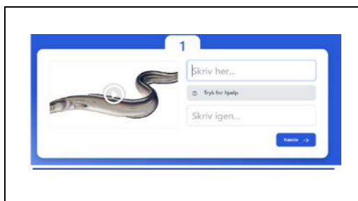
Figure 2. How target words are presented in AiRO

In AiRO the user are presented to 3 new and 3 earlier practiced target words at each level. At the initial level, target words are short (1-2 letters) with V, CV and VC structure (e.g. "å" stream , "is" ice cream ) and straightforward pronunciation (see how target words are presented in figure 2). Only letters E, I, L, S, Å are used, and only the most basic letter-to-sound rules are in play. In general, rules trained at one level carry over to the next so that easier rules are practiced before more difficult ones. A total of 20 letter-to-sound rules are covered. The entire course comprises 16 levels, first focusing on the vowels and fricatives, then gradually introducing the plosives. The purpose is to create a learning situation that systematically and directly introduces the user to phonics applied in spelling with abundant opportunity for the user to practice at the appropriate level of instruction and progression.